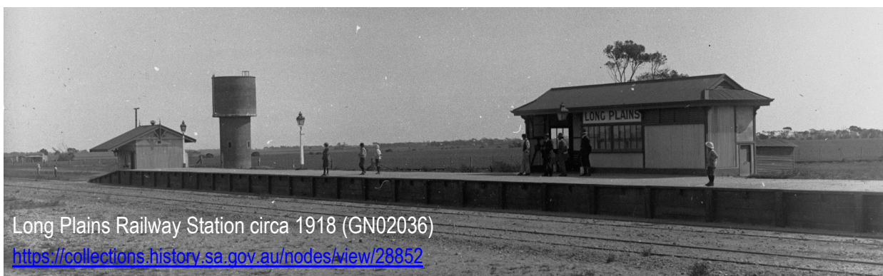
Long Plains Railway Station circa 1918 (GN02036) https://collections.history.sa.gov.au/nodes/view/28852

OUR NEWSLETTERS. (1915, July 1). The Wooroorra Producer (Balaklava, SA : 1909 - 1940), p. 3. http://nla.gov.au/nla.news-article207099437