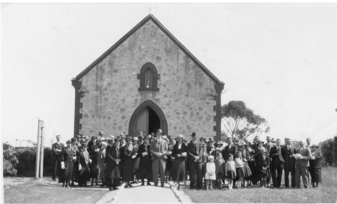
St Peters Anglican Church - Golden Jubilee Celebration September 1934

Sundays at 5.00pm (beginning with a shared meal)