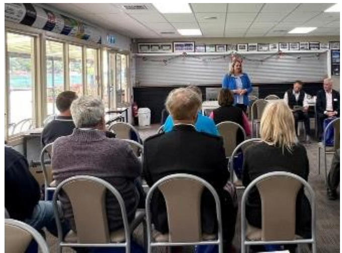
Pictured: Recent community forum on the topic of Regional Health and Transport Limitations in Clare.

My team and I have been calling the hotline each time a road issue is raised, and I encourage you to do the same . I think it is important to present as much information to this CITY hotline as we can to demonstrate the volume of work required to make our country roads safe.