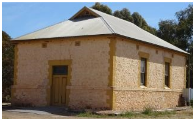
2023 is the centenary of the Avon Sunday School Hall see page 11 for details of event

Avon on the Adelaide Plains. Former Avon Sunday School Hal...