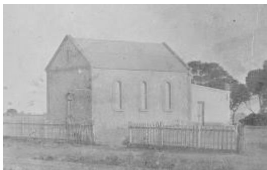
Windsor Methodist Church Pre 1910

Sundays at 5.00pm (beginning with a shared meal)