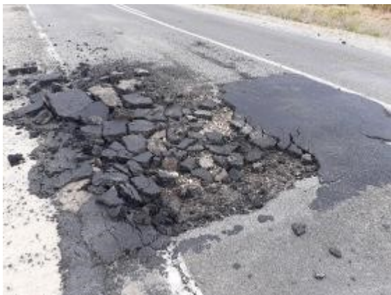
Pictured: Owen Road, Mallala

It is no real surprise given the unseasonal rains we had last year, that some of our local roads are really in poor condition. I have been very concerned about safety and costly damage to vehicles. Each time I hear of a road needing repair I email the Minister for Regional Roads and include photos (a picture really does tell a thousand words).