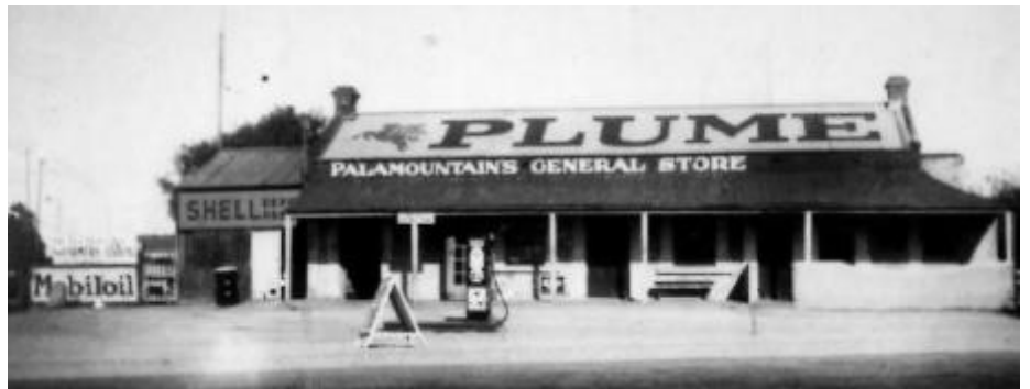
1. Windsor Store Circa 1952