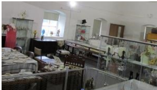
Margaret Tiller Gallery

Mallala Museum volunteers have not been idle during lockdown. The upstairs gallery has been completely refurbished and has been renamed the Margaret Tiller Gallery. This is to pay homage to one of our most hardworking and dedicated volunteers who devoted many years to the museum. This exhibition area houses our display of domestic items, including toys, costumes, furniture and household items.