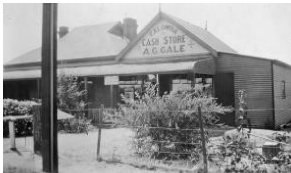
2. Calomba Store and Post Office Circa 1935